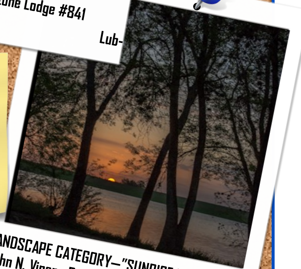
LANDSCAPE CATEGORY—"SUNRISE IN THE PARK" John N. Viner—Randolph Lodge #1268 Live Oak, Texas

Submit photos to Grand Lodge Photo Contest