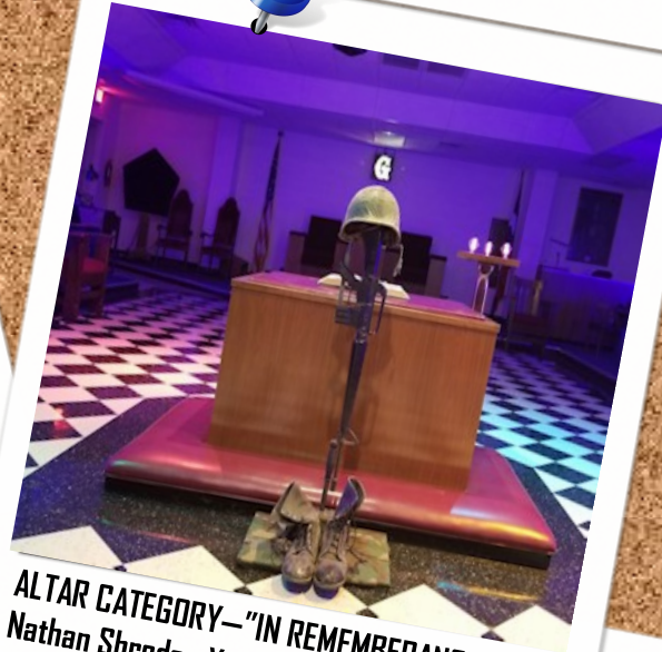
ALTAR CATEGORY—"IN REMEMBRANCE" Nathan Shrade—Yellowstone Lodge #841 Lub-